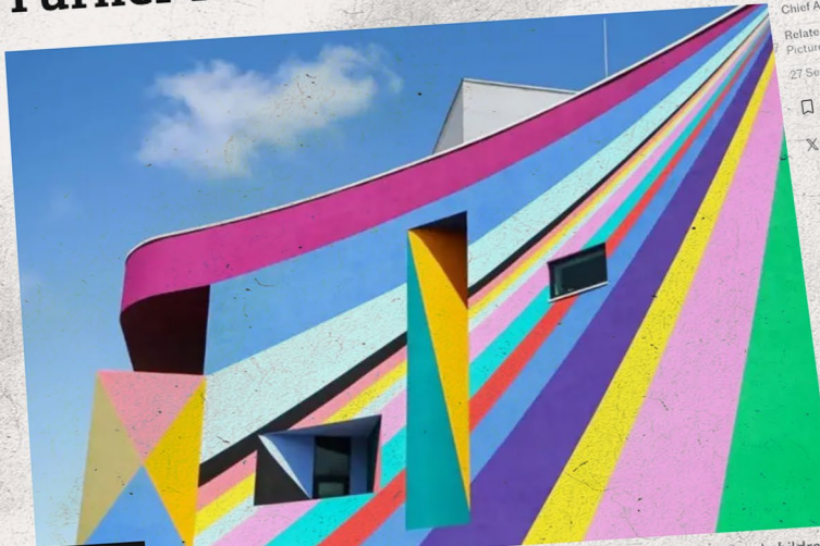
EVA EASTMAN Towner Eastbourne said 60,000 people have visited the exhibition so far, including 3,500 school children